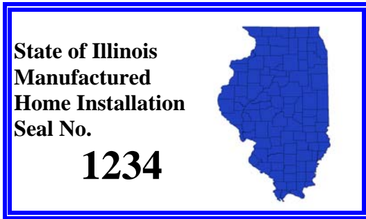
Example of Installation Seal

The seal is to be placed above the red HUD label located on the exterior of each home after the home is installed. It has a unique number that will allow the Department to determine the responsible installer. The certificate provides the Department with information regarding the location of the home, date of installation, and the name of the owner, dealer and manufacturer of the home. One of the four copies of this form is to be returned to the Department within 30 days, with a copy provided to the homeowner and to the dealer. Seals and certificates can only be purchased by request from a licensed manufactured home installer. Several seals and certificates can be ordered at one time.